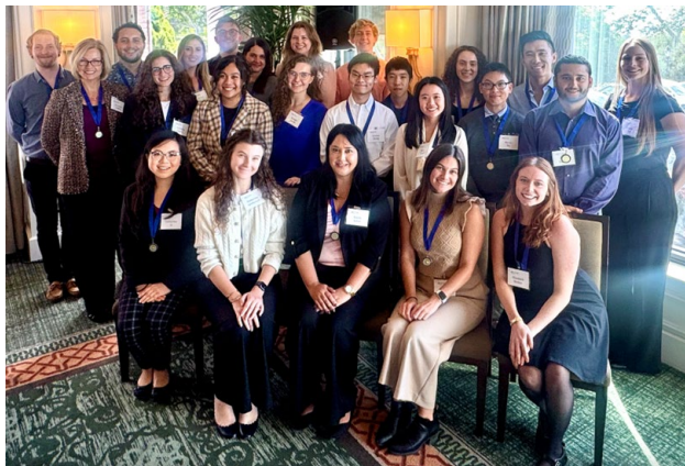
2024-2025 First-Year ARCS Scholars