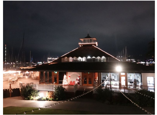
San Diego Yacht Club